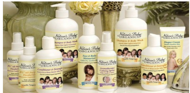
Nature's Baby Organics has other fantastic products like diaper cream, moisturizer and shampoo.

Great for scrapes, dry skin, chapped lips and more. We love the roll-up tube design that's easy to use & easy to take on-the-go. All organic, all natural ingredients and no chemicals make this the perfect product for babies and kids. All are doctor recommended & great for sensitive skin. A favorite of many celebrity parents, Nature's Baby has been featured on The Early Show, E! News and in People Magazine.